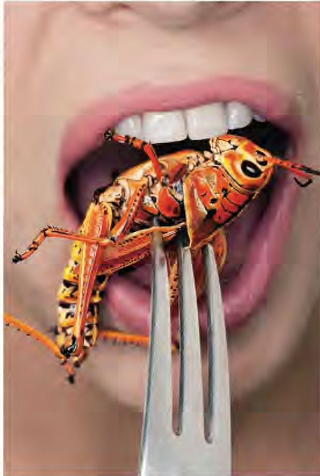
In Oaxaca, grasshoppers are popular snacks, but shrimp are shunned.

DeFoliart envisioned a place for edible insects as a luxury item. The larvae of the wax moth ( Galleria mellonella ) seemed to him to be poised to become the next escargot, which in the late eighties represented a three-hundred-million-dollar-a-year business in the United States. “Given